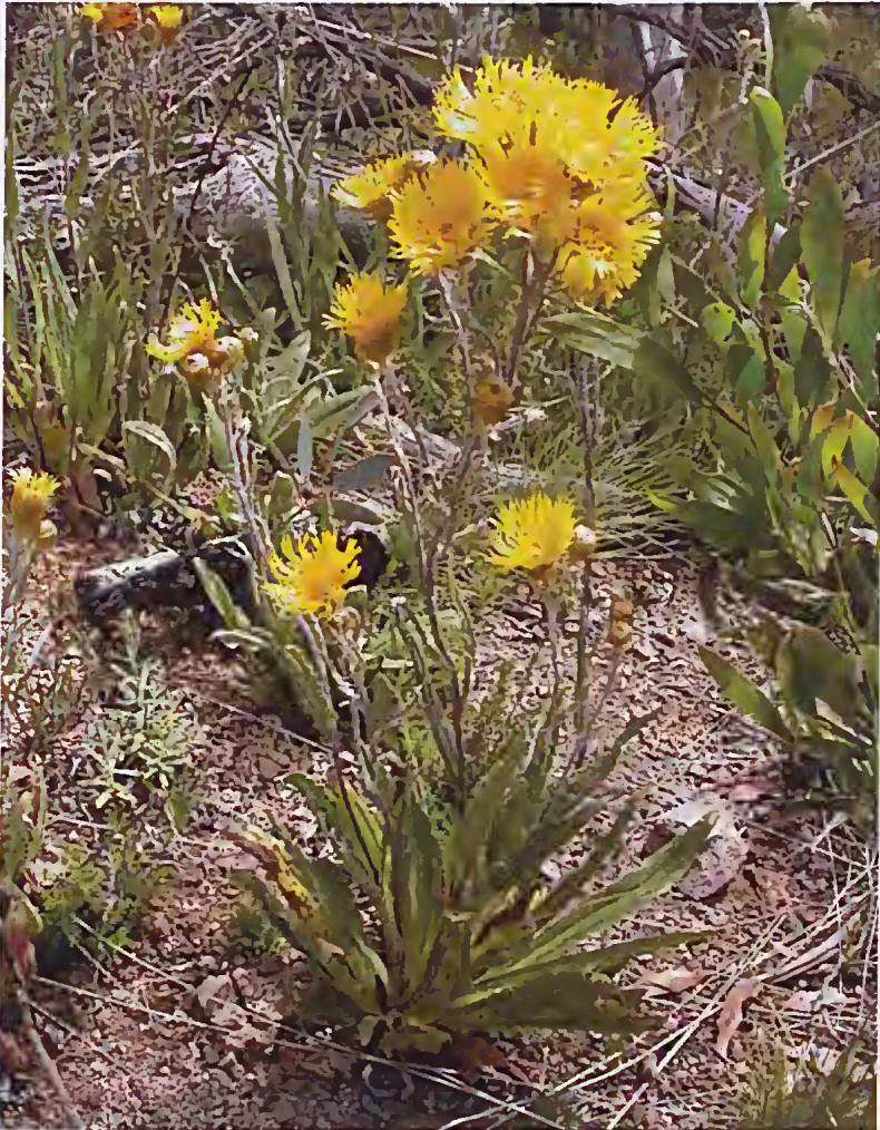
Figure 2. Podolepis locinioto , Big River Fire Trail, Bogong High Plains, Victoria

Podolepis robusta usually occurs above the ( Eucalyptus pouciflora ) treeline (or below where the treeline is